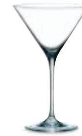
Martini 28 Martiniglas 28 21 cl 7 oz H183 mm 7 1/4" D112 mm 4 1/2" No. 6006 2800