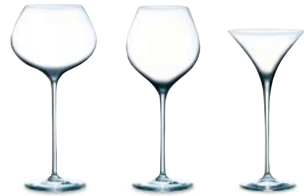
Burgundy 36 Burgunder 36 73 cl 24 1/2 oz H260 mm 10 1/4" D124 mm 5" No. 6051 3600 Burgundy 10 Burgunder 10 65 cl 22 oz H260 mm 10 1/4" D 109 mm 4 1/4" No. 6051 1000 Martini 28 Martiniglas 28 24 cl 8 oz H240 mm 9 1/2" D 127 mm 5" No. 6051 2800