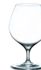
Brandy 21 Cognacschenker 21 40 cl 14 oz H 146 mm 5 3/4" D 94 mm 3 3/4" No. 6006 2100