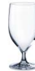
Goblet 20 Wassergoblet 20 37 cl 12 1/2 oz H167 mm 6 5/8" D 80 mm 3 1/4" H=0,31