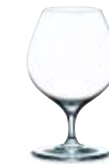
Brandy 21 Cognacschenker 21 66 cl 22 1/4 oz H 166 mm 6,5" D 122 mm 4,5" No. 6001 2100