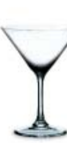
Martini 28 Martiniglas 28 30 cl 10 1/4 oz H188 mm 7 1/2" D125 mm 4 1/2" No. 6103 2800