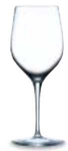
Wine 02 Weinkelch 02 36 cl 12 1/4 oz H205 mm 8 1/4" D 83 mm 3 1/4" No. 6050 0200 H:0,21