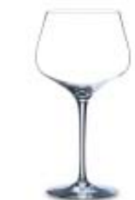
Burgundy 10 Burgunder 10 66 cl 23 1/4 oz H 225 mm 8,5" D 120 mm 4,5" No. 6103 1000