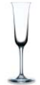
Liqueur 05 Likörkelch 05 7,5 cl 2 1/2 oz H188 mm 7 1/2" D 64 mm 2 1/2" No. 6050 0500