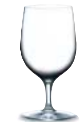
Mineral water 11 Mineralwasser 11 31 cl 10 1/2 oz H150 mm 6 " D 78 mm 3 " No. 6050 1100 H:0,21