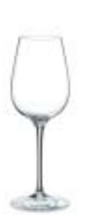
Wine 03 Weinkelch 03 25 cl 8 1/2 oz H208 mm 8 1/4" D 73 mm 2 3/4" No. 6265 0300 H:0,11 H:0,21