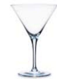
Martini 28 Martiniglas 28 30 cl 10 1/4 oz H 188 mm 7,5" D 125 mm 4,5" No. 6103 2800