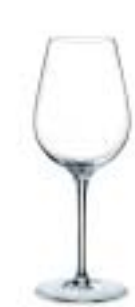
Wine 02 Weinkelch 02 35 cl 12 oz H208 mm 8 1/4" D 81 mm 3 1/8" No. 6265 0200 H:0,21