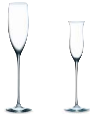
Champagne flute 07 Sektkelch 07 18 cl 6 oz H275 mm 10 3/4" D 66 mm 2 1/2" No. 6051 0700 Grappa 35 Schnapsglas 35 9 cl 3 oz H245 mm 9 1/2" D 66 mm 2 1/2" No. 6051 3500