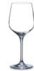
Wine 01 Weinkelch 01 51 cl 17 1/4 oz H 230 mm 9" D 96 mm 4" No. 6103 0100