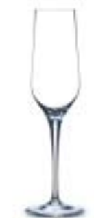
Champagne flute 07 Sektkelch 07 22 cl 7 1/2 oz H 250 mm 10" D 74 mm 3" No. 6103 0700