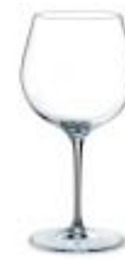
Burgundy 10 Burgunder 10 61 cl 20 3/4 oz H213 mm 8 1/2" D105 mm 4" No. 6265 1000