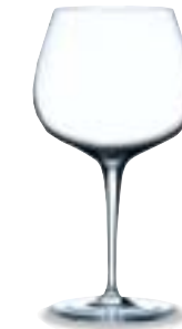
Burgundy 10 Burgunder 10 68 cl 23 oz H210 mm 8 1/4" D114 mm 4 1/2" No. 6050 1000