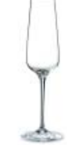
Champagne flute 07 Sektkelch 07 18 cl 6 oz H238 mm 9 1/2" D 70 mm 2 3/4" No. 6265 0700 H:0,11