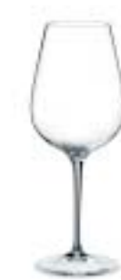
Wine 01 Weinkelch 01 44 cl 15 oz H228 mm 9" D 87 mm 3 1/2" No. 6265 0100 H:0,21