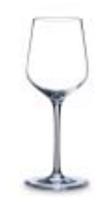
Wine 03 Weinkelch 03 26 cl 8 3/4 oz H 200 mm 8" D 77 mm 3" No. 6103 0300