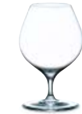
Brandy 21 Cognacschwenker 21 40 cl 13 1/2 oz H146 mm 5 3/4" D 94 mm 3 1/4" No. 6006 2100 H:2+4d H:2d