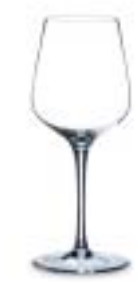
Wine 02 Weinkelch 02 36 cl 12 1/4 oz H 210 mm 8" D 86 mm 3,5" No. 6103 0200