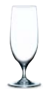
Pilsener 19 Biertulpe 19 46 cl 15 1/2 oz H 196 mm 8" D 78 mm 3" No. 6001 1900