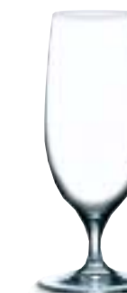
Pilsener 19 Bierglas 19 36 cl 13 oz H 184 mm 7 1/4" D 79 mm 3 1/8" No. 6006 1900