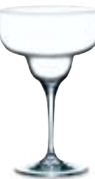
Margarita 32 Margarita 32 34 cl 11 1/2 oz H172 mm 6 3/4" D111 mm 4 1/2" No. 6006 3200