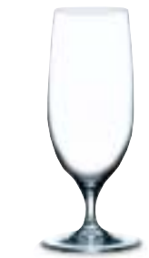
Pilsener 19 Biertulpe 19 36 cl 12 1/4 oz H184 mm 7 1/4" D 79 mm 3 1/4" No. 6006 1900 H:0,31