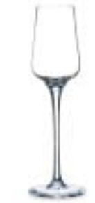
Cordial 34 Likörkelch 34 10 cl 3 1/2 oz H 200 mm 8" D 60 mm 2,5" No. 6044 3400