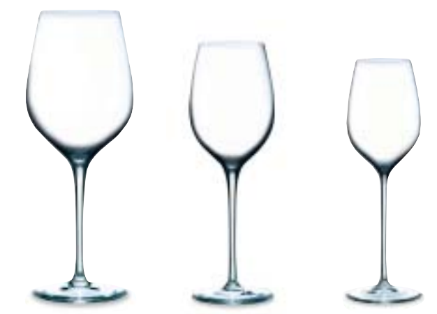
Bordeaux 00 Bordeaux 00 67 cl 22 3/4 oz H270 mm 10 3/4" D 103 mm 4" No. 6051 0000 Wine 01 Weinkelch 01 46 cl 15 1/2 oz H255 mm 10" D 85 mm 3 1/4" No. 6051 0100 Wine 02 Weinkelch 02 32 cl 10 3/4 oz H240 mm 9 1/2" D 78 mm 3" No. 6051 0200