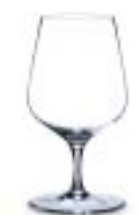
Mineral water 11 Mineralwasserglas 11 36 cl 12 1/4 oz H 151 mm 6" D 86 mm 3 1/2" No. 6275 1100