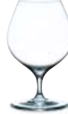
Brandy 21 Cognac schwenker 21 40 cl 13 1/2 oz H146 mm 5 3/4" D 94 mm 3 1/4" No. 6006 2100 H:2+4d H:2d