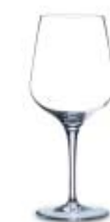
Bordeaux 00 Bordeaux 00 65 cl 23 oz H 240 mm 9,5" D 104 mm 4" No. 6103 0000